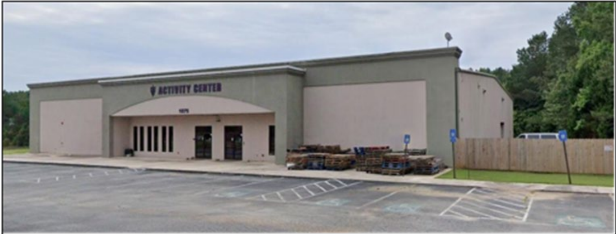
Springfield Baptist Church – Activity Center 1875 Iris Dr SE, Conyers, Rockdale County, Georgia 30013