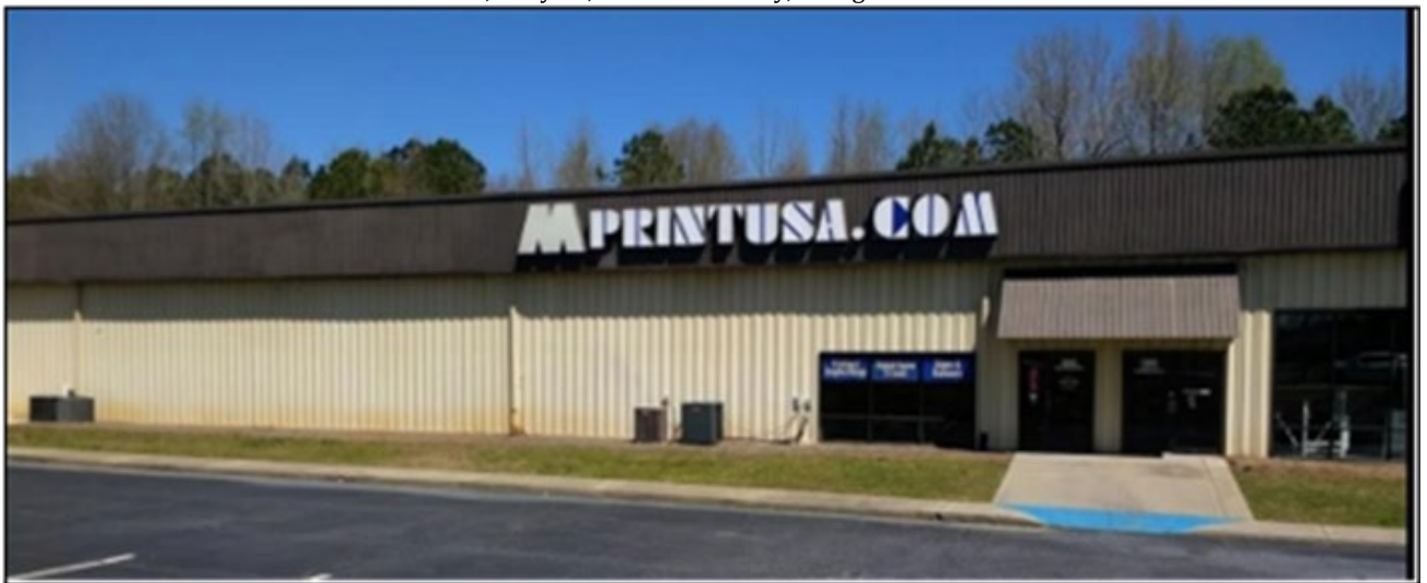
Print Shop Building 1680 Dogwood Dr SE, Conyers, Rockdale County, Georgia 30013